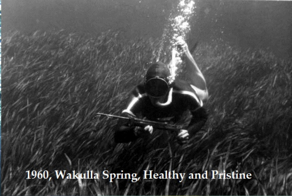
1960, Wakulla Spring, Healthy and Pristine